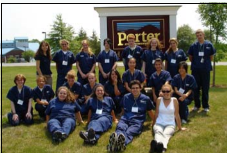
Participants in the July MedQuest Program pose outside of Porter Medical Center before starting a day of shadowing experiences.