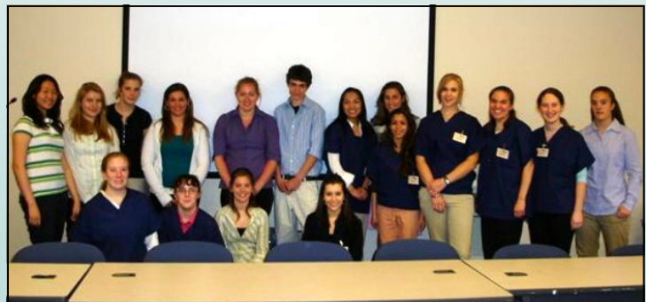
Participants in the Fletcher Allen Health Care Shadow Day Program.

When surveyed after the Shadow Day Program, 82% of the students stated that their interest in a health care career had increased as a result of participating in the program, and 12% stated their interest had stayed the same. All the participants stated that they did plan on attending college after high school.