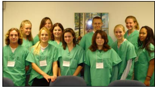
Participants in the Porter Medical Center Shadow Day Program.

When surveyed after the Shadow Day, 89% stated their interest in a health care career had increased as a result of participating in the program. All participants stated that they did plan on attending college after high school.